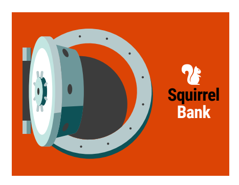
Online banking provides many security features to keep your money safe

Always log off online banking when you've finished a session – don't simply switch off your computer. And never use public computers or free public Wi-Fi for your online banking.