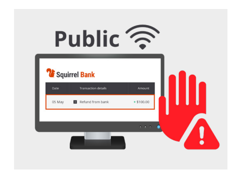
Public Wi-Fi is not secure, so never use it for online banking