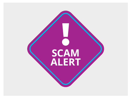
Never click on a link in an email that claims to be from your bank – chances are it's a scam